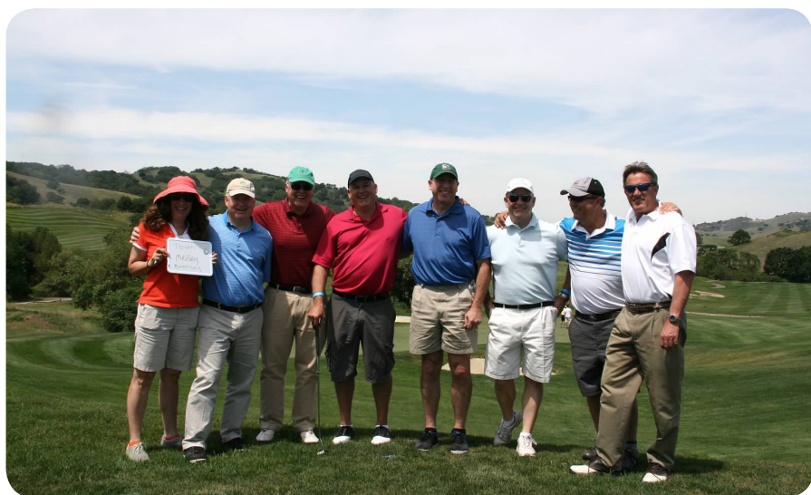
2014 PACE Classic Golfers & Staff