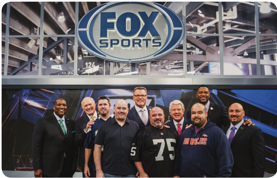
"On the Set" Fox Tour Winners from 2014