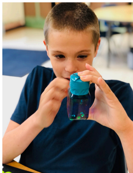
(A PACE School student enjoys a sensory activity)