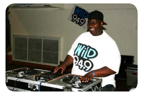
The WiLD 94.9 DJ spinning some beats