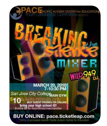
YLC Breaking the Silence Mixer Flyer