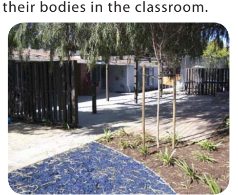
Lamar House after construction: March 2010

Christine considered every detail in providing a unique space for individuals with Autism. For instance, she levelled all the ground flush to avoid tripping hazards. Partly transparent partition screens divide the three distinct spaces, which allow one to see through but still gives a psychological sense of separation. This makes it easier for the brain to structure and process the landscape. Christine got the idea for the screens from touring PACE School: she noticed that the students used their desks to provide order and structure for