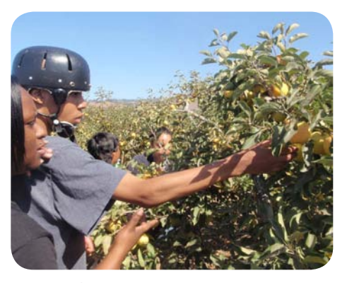
Student participation in community experiences: apple picking

Thank you to all PACE staff for supporting such a wonderful learning environment for PACE students!