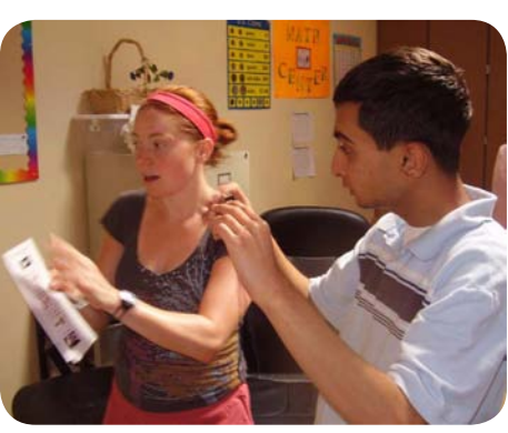
Effective use of pictorials