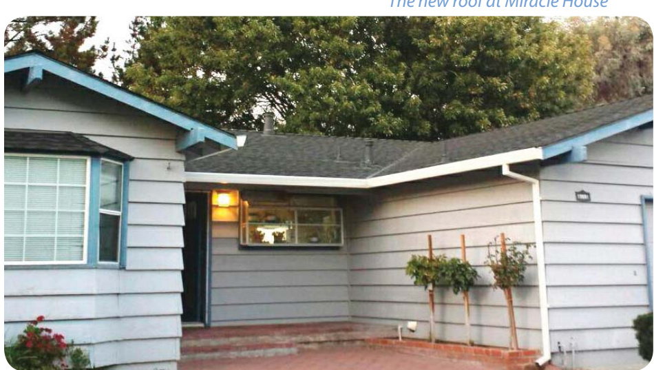
The new roof at Miracle House

Thanks again to all the PACE supporters who made the new roof at Miracle House, new floors for Meadows House, and a fresh coat of paint for our school a reality!